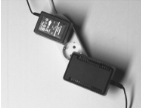
Fig. 1: Standard Wall-Packs